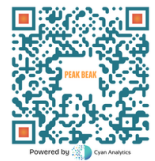
QR codes on label for verified sustainability data